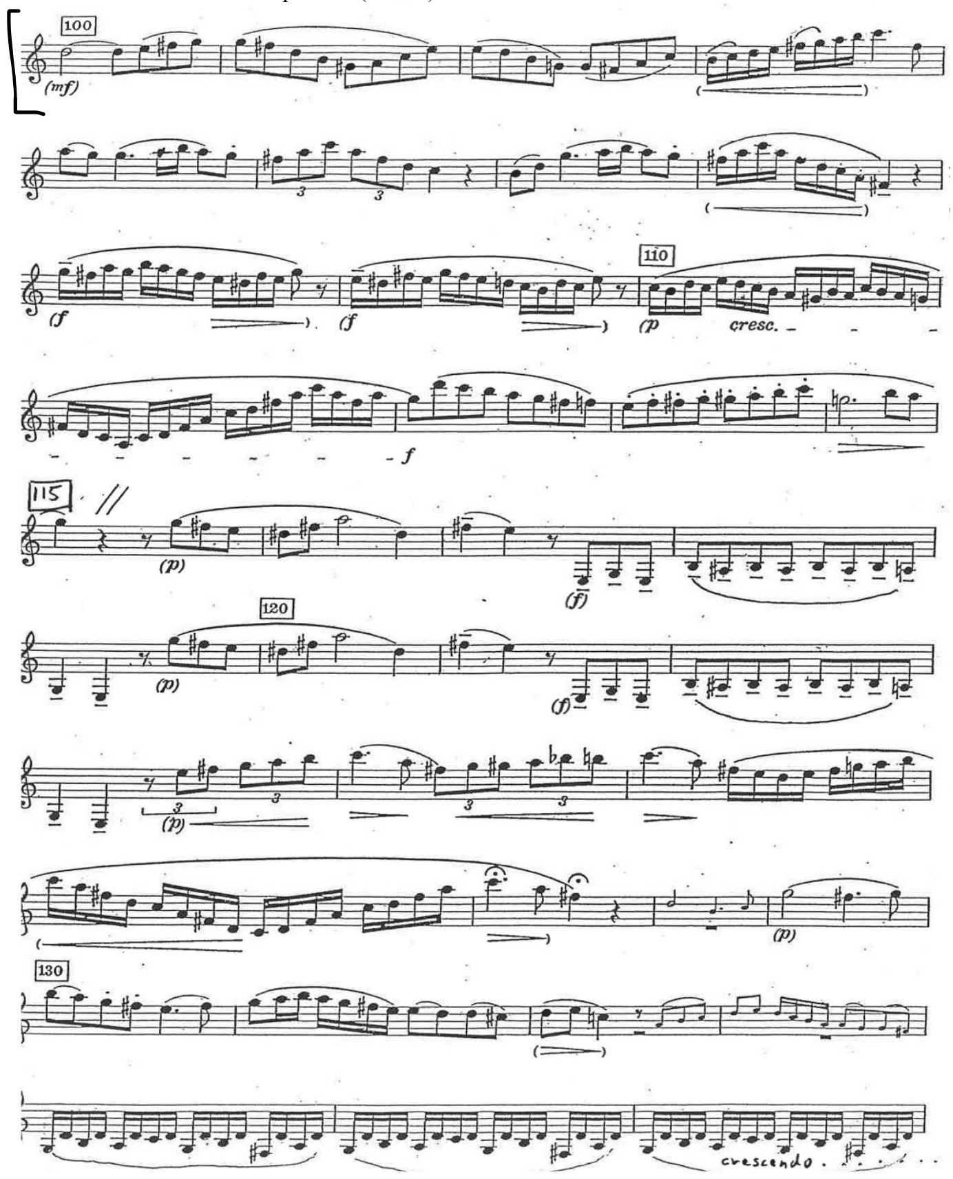
UNM Large Ensemble Audition-Clarinet-Fall 2024

Measure 100 to end of exposition (m. 154)