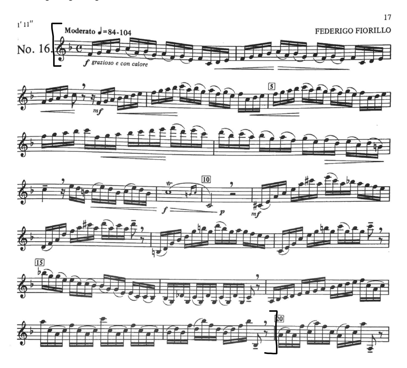
Rose 40 Etudes #16 Moderato beginning through end of measure 19